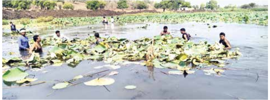
Lake cleaning activities at Futala Lake, Nagpur