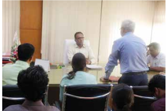
Equi-City Team along with AILSG Regional Director Nagpur briefing about the activities under Equi-City project