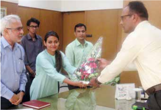
Equi-City Team welcoming newly appointed Municipal Commissioner